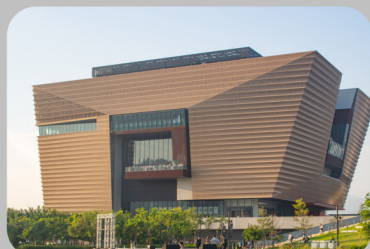
The West Kowloon Cultural District