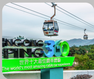
Ngong Ping 360