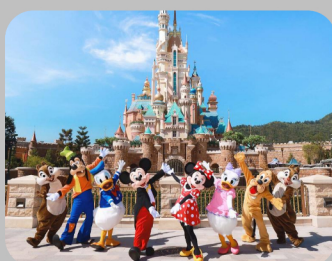
Hong Kong Disneyland