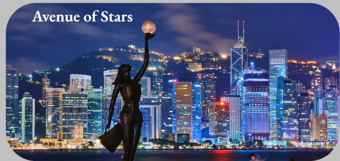
Avenue of Stars